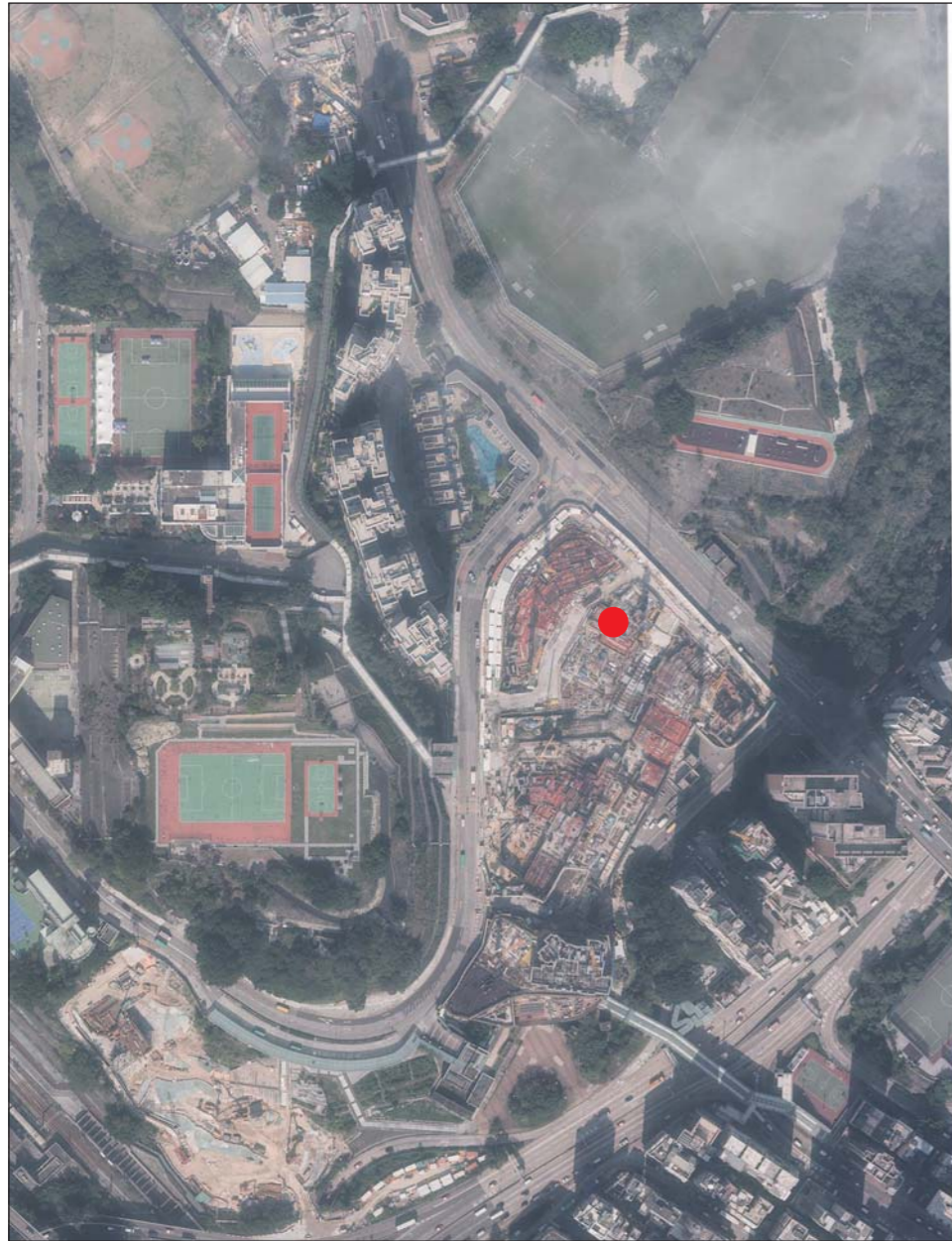
This blank area falls outside the coverage of the relevant Aerial Photograph 鳥瞰照片並不覆蓋本空白範圍