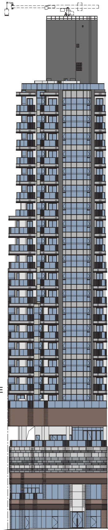
ELEVATION C 立面 C