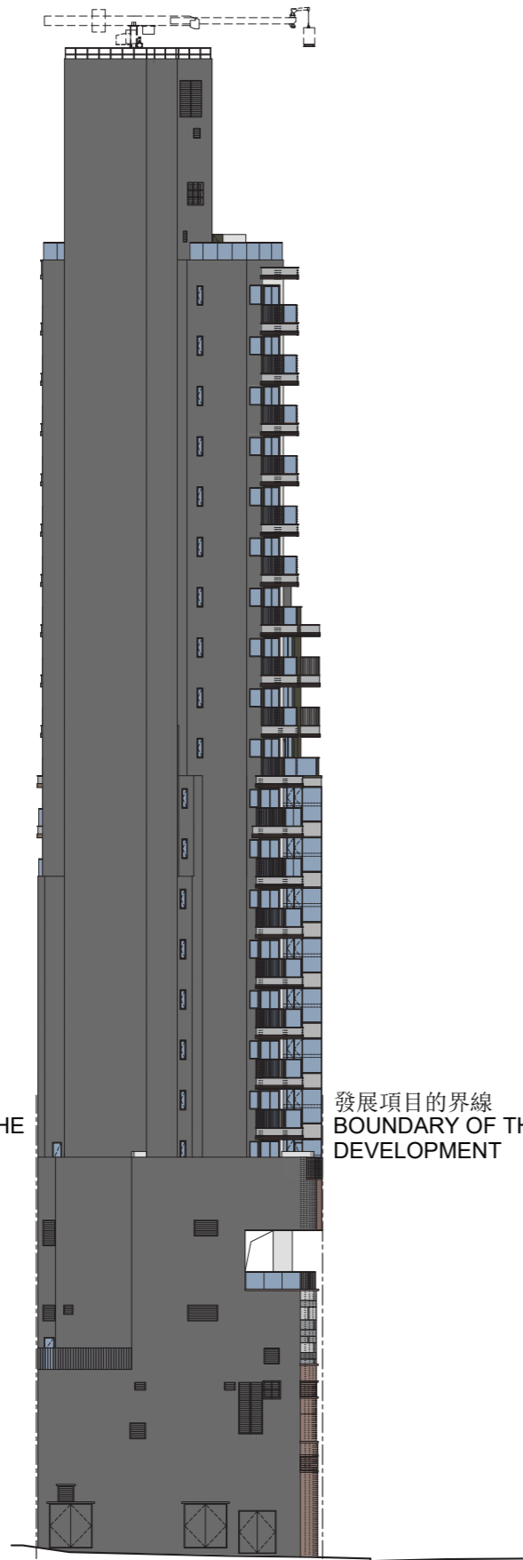
ELEVATION A 立面 A