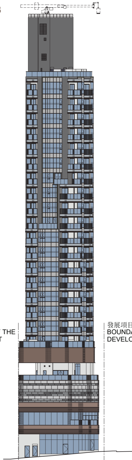
ELEVATION B 立面 B