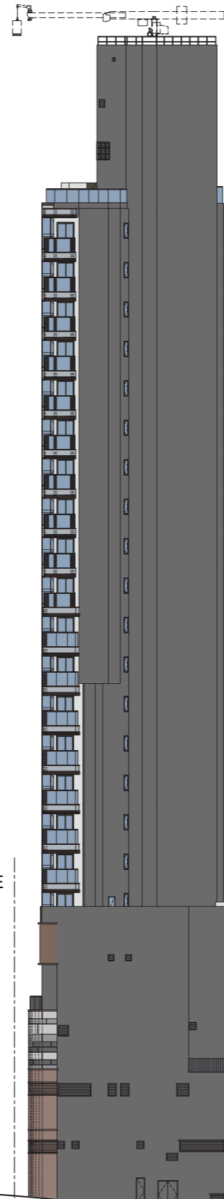
ELEVATION D 立面 D