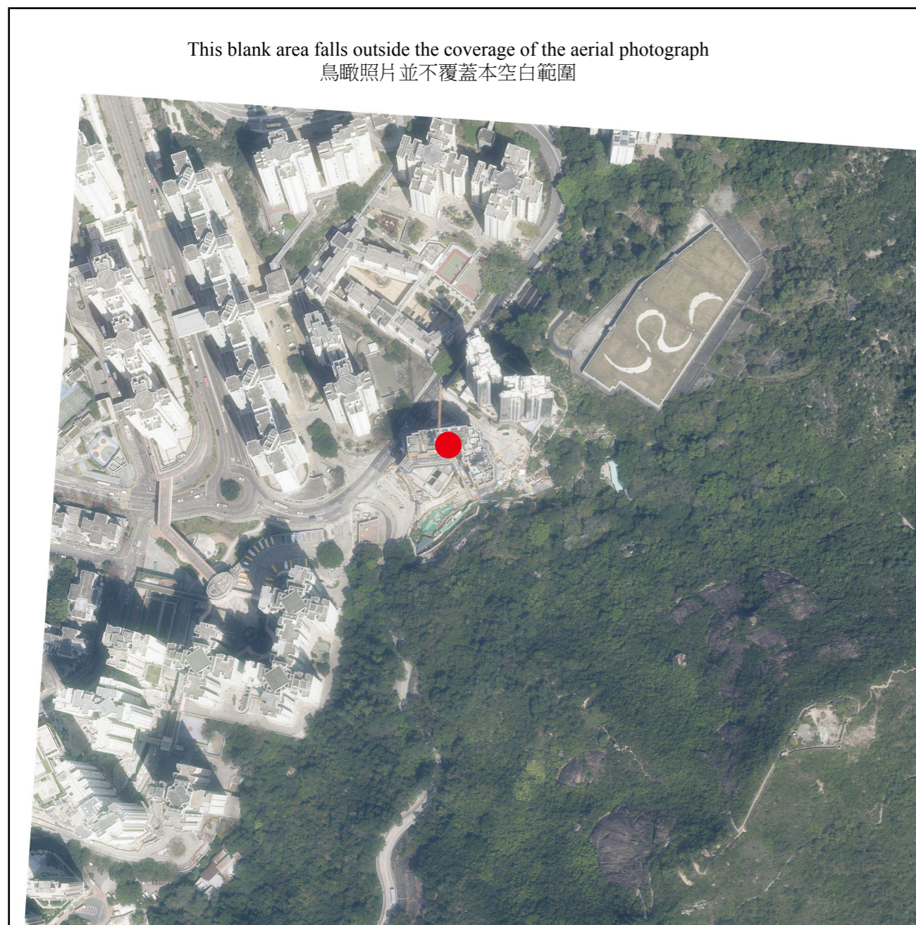
● Location of the Development 發展項目的位置