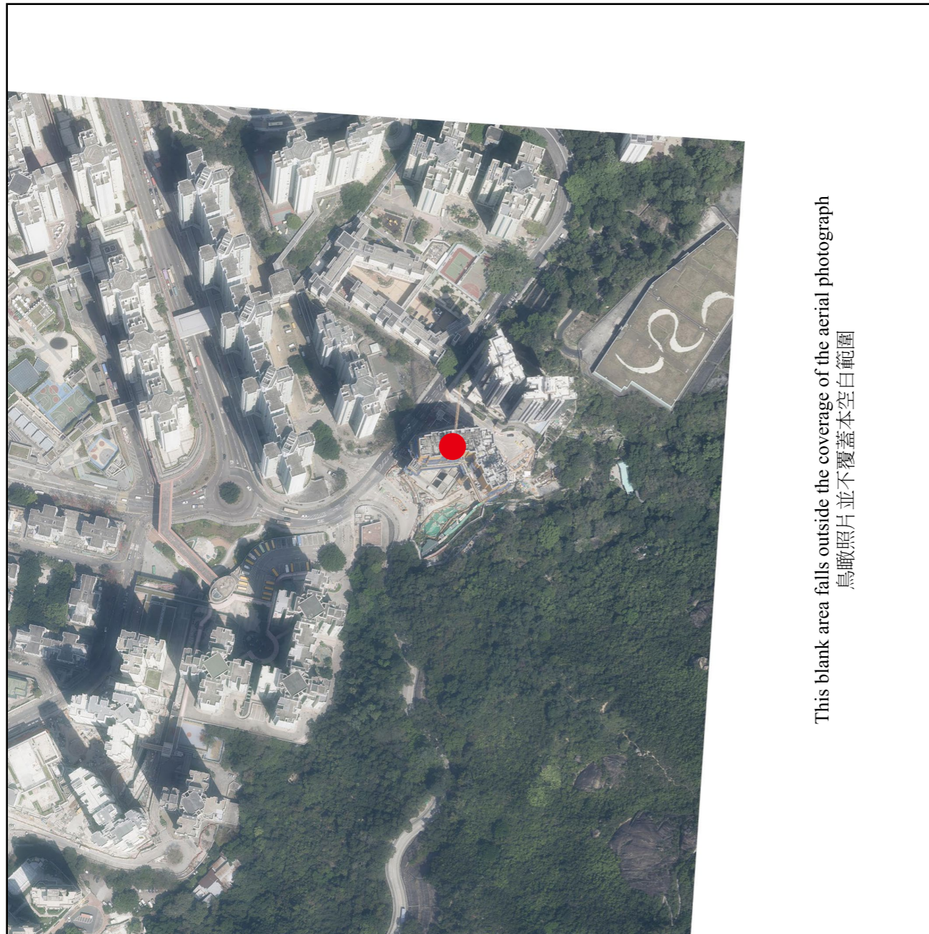
This blank area falls outside the coverage of the aerial photograph 鳥瞰照片並不覆蓋本空白範圍