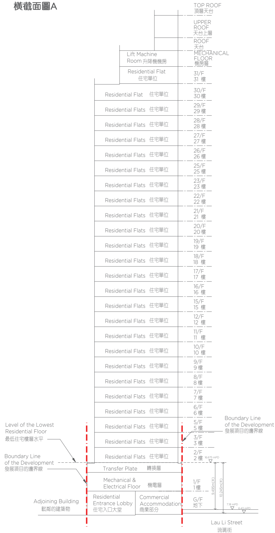
Cross-section Plan A 橫截面圖A