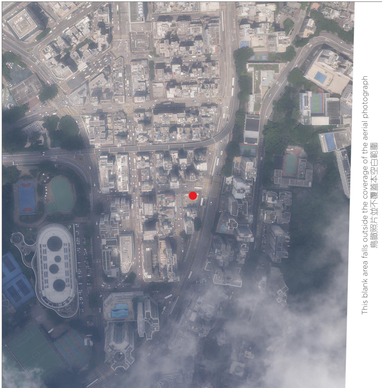
This blank area falls outside the coverage of the aerial photograph 鳥瞰照片並不覆蓋本空白範圍