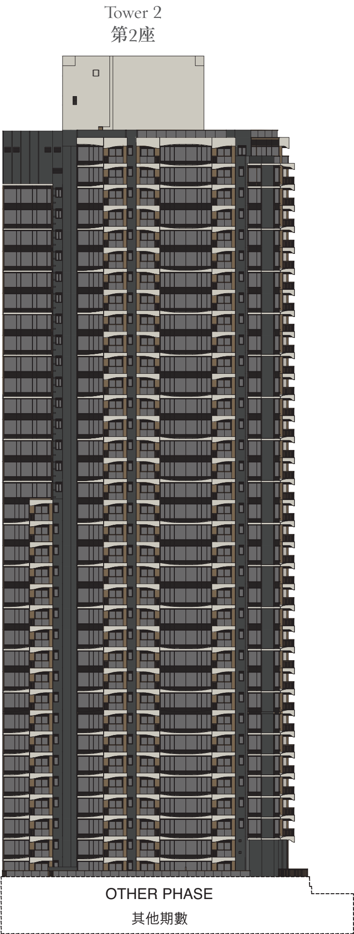
Elevation Plan 2 立面圖2