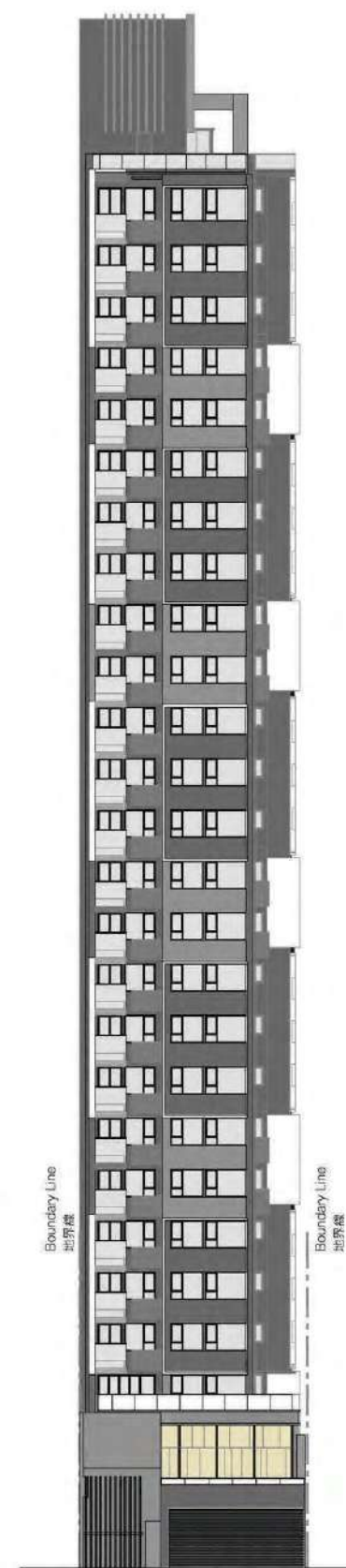
SOUTH-WEST ELEVATION 西南立面圖

Authorized Person for the Development certified that the elevations shown on these plans: