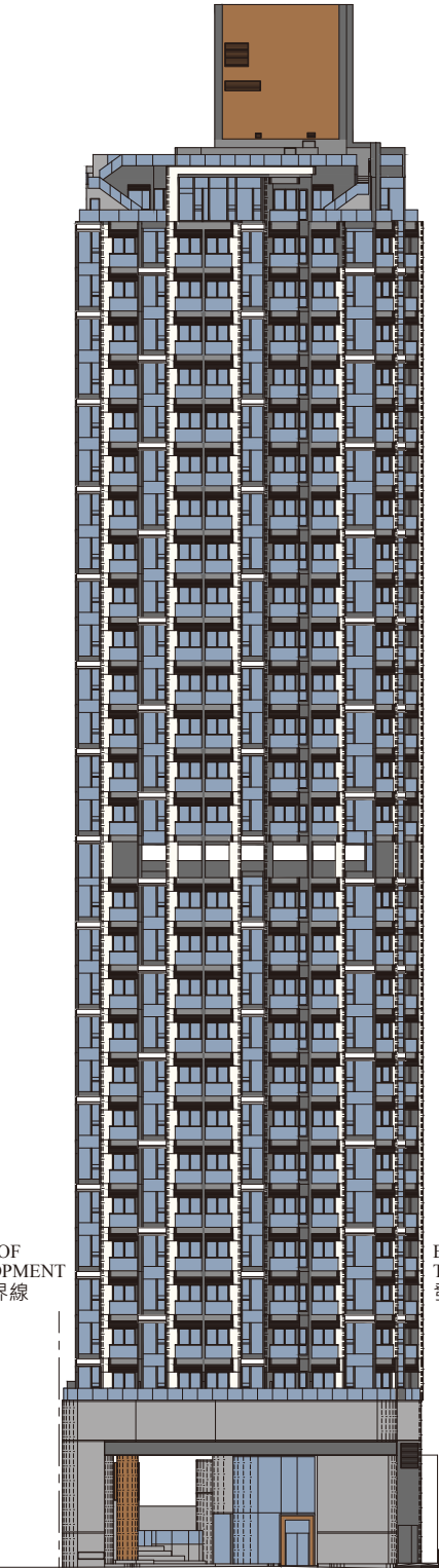
ELEVATION A 立面 A