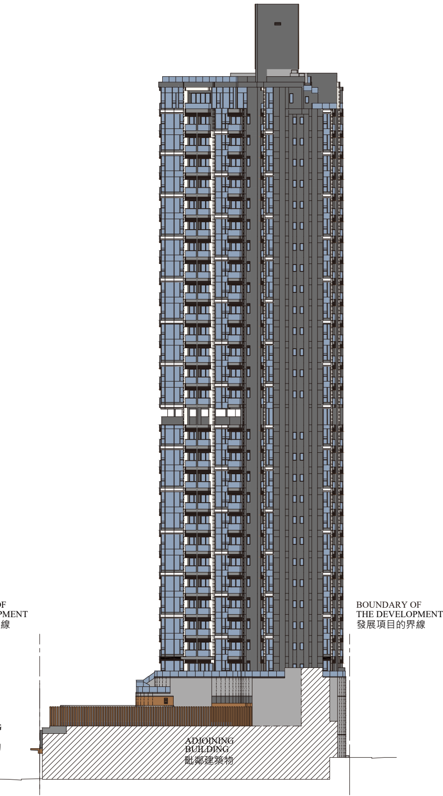
ELEVATION D 立面 D