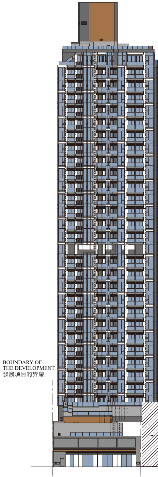
ELEVATION C 立面 C