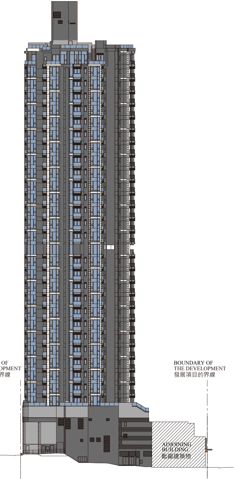
ELEVATION B 立面 B