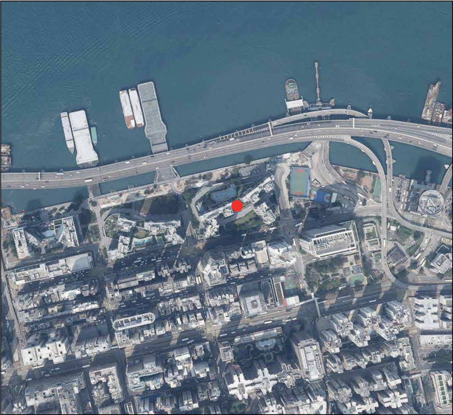
Location of the Phase 期數的位置

Survey and Mapping Office, Lands Department, The Government of HKSAR © Copyright reserved - reproduction by permission only 香港特別行政區政府地政總署測繪處 © 版權所有，未經許可，不得複製。