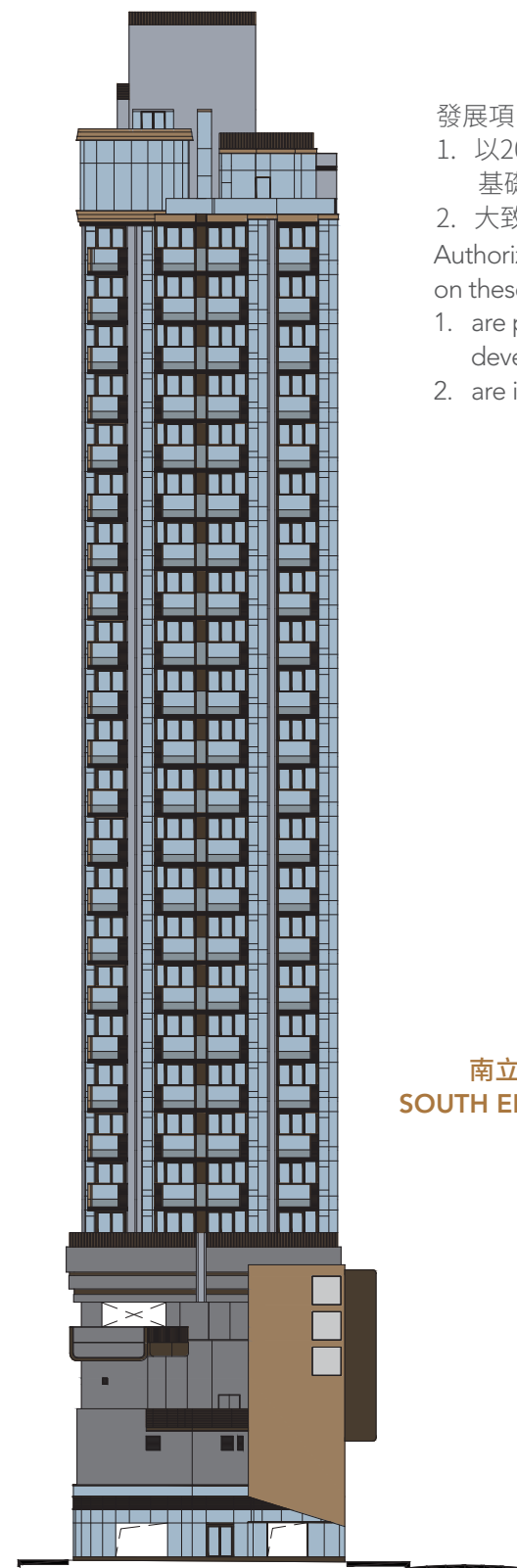
南立面圖 SOUTH ELEVATION