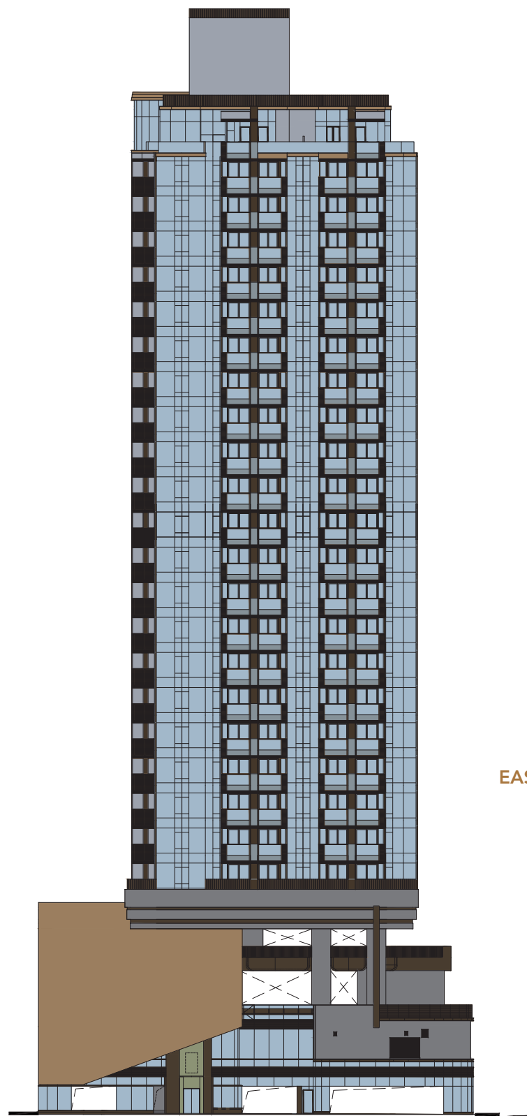
東立面圖 EAST ELEVATION