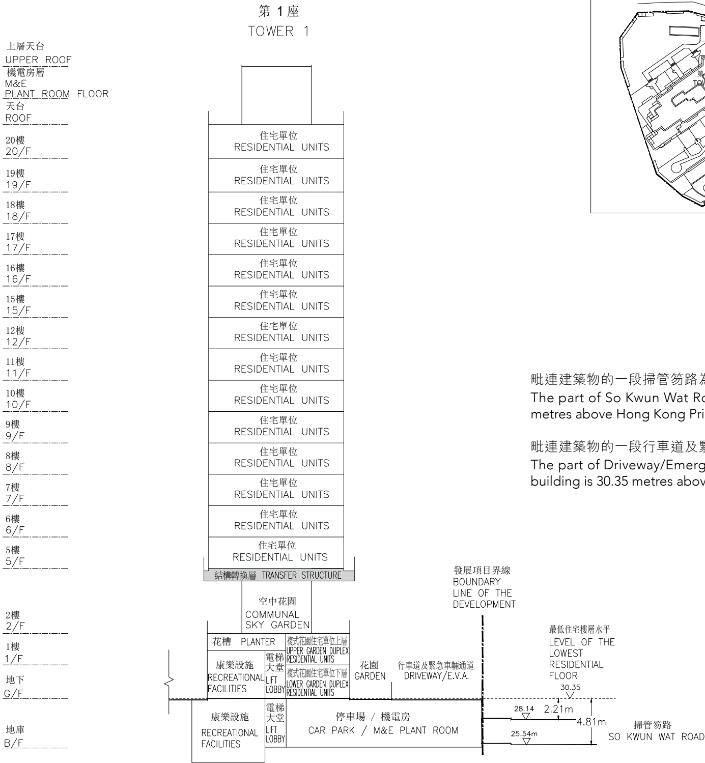
第1座 Tower 1 橫截面圖 A-A Cross-Section Plan A-A