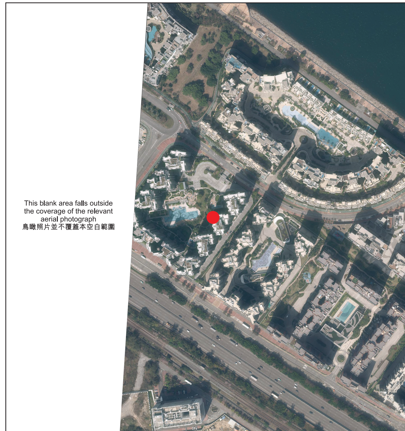
● Location of the Phase 期數的位置

Adopted from part of the aerial photograph taken by the Survey and Mapping Office of Lands Department at a flying height of 6,900 feet, photo No. E189296C, date of flight 27th February 2023.