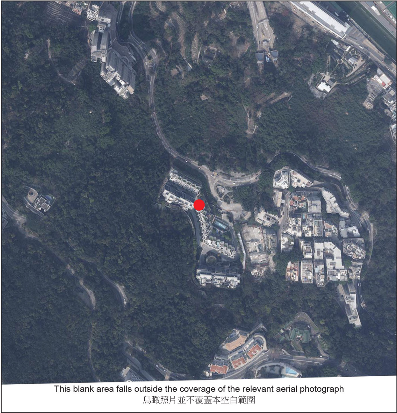
This blank area falls outside the coverage of the relevant aerial photograph 鳥瞰照片並不覆蓋本空白範圍