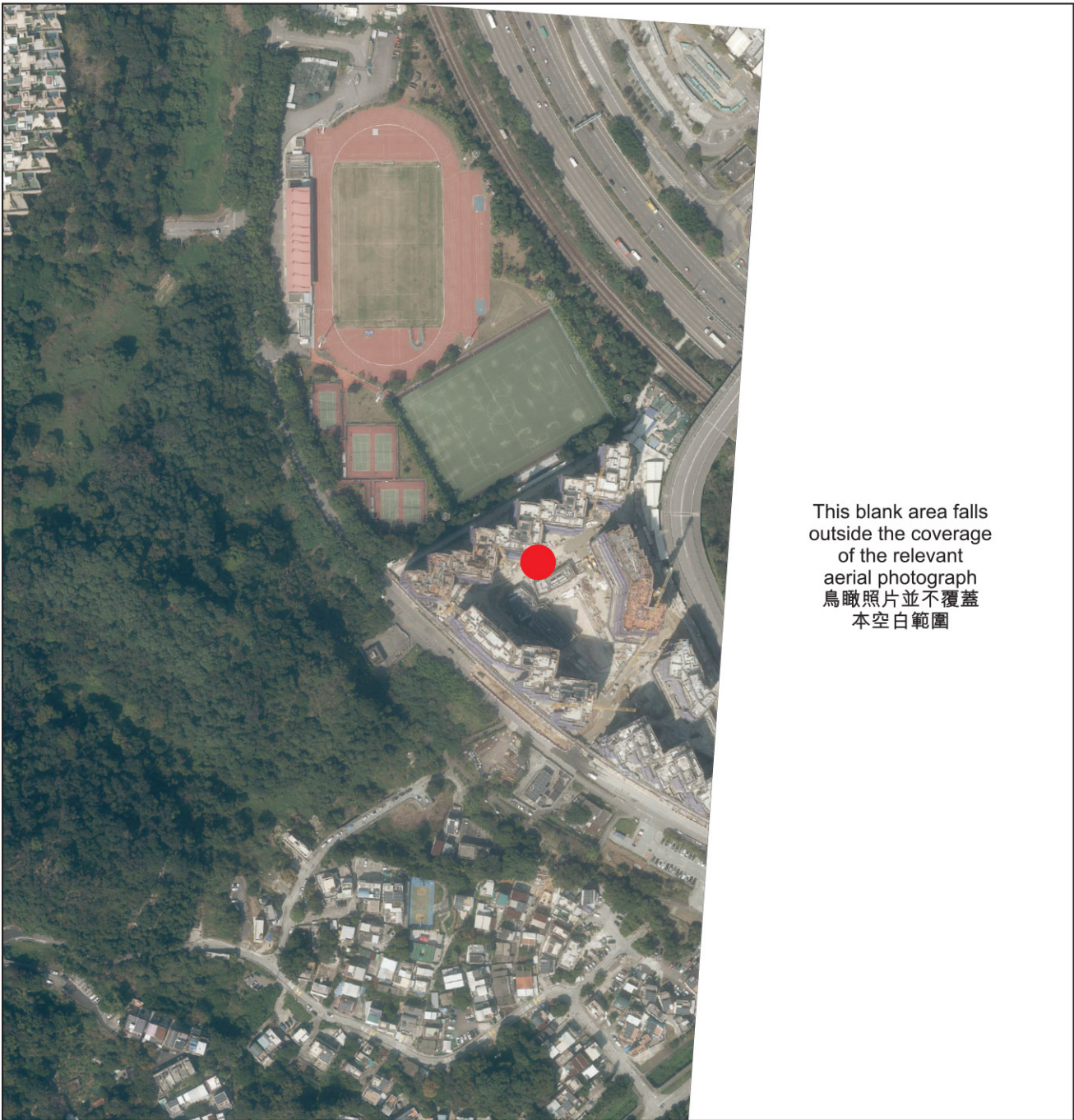
● Location of the Phase 期數的位置

Adopted from part of the aerial photograph taken by the Survey and Mapping Office of Lands Department at a flying height of 6,900 feet, photo No. E189743C, date of flight 27 February 2023.