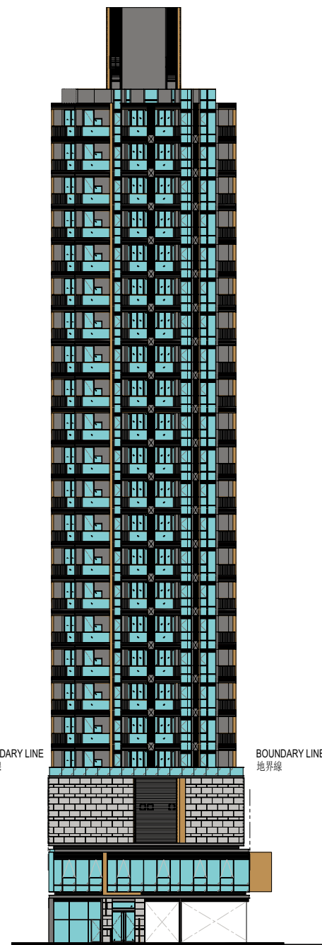
SOUTH EAST ELEVATION 東南立面圖