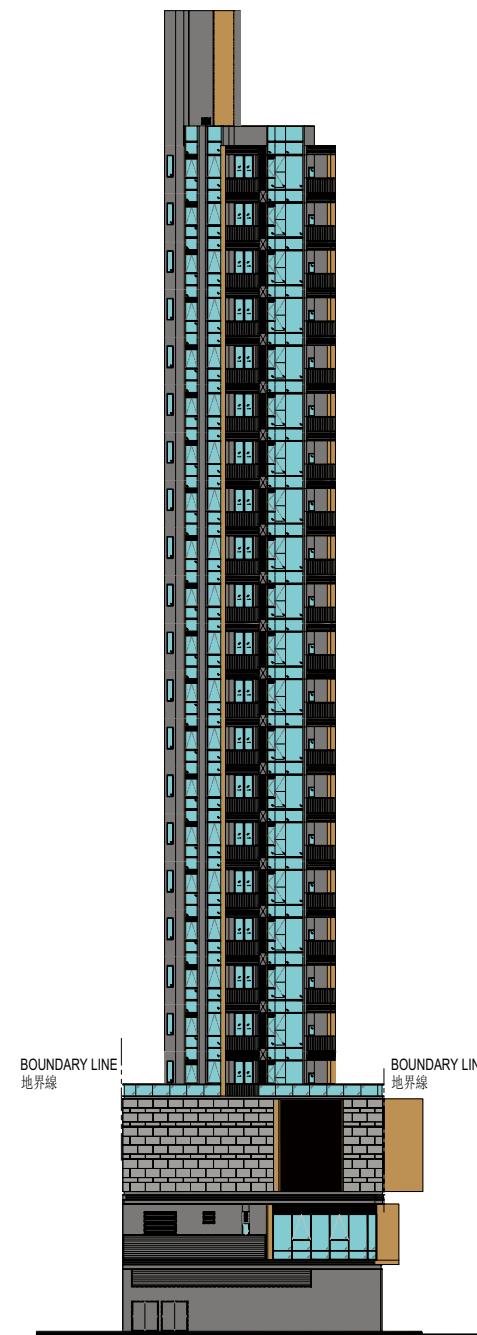
SOUTH WEST ELEVATION 西南立面圖