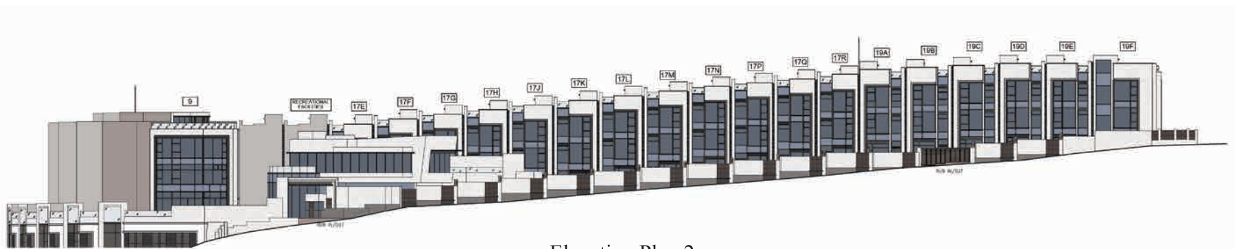
Elevation Plan 2 立面圖二