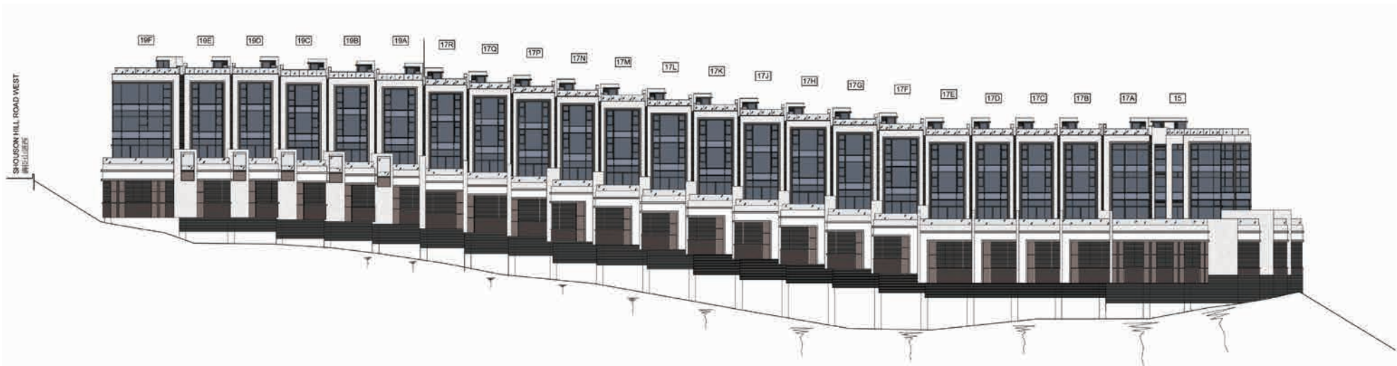
Elevation Plan 1 立面圖一