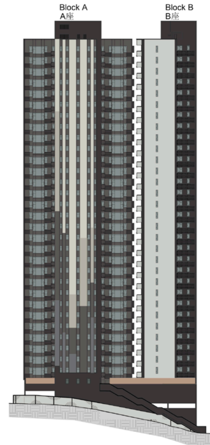
South Elevation 南面立面圖