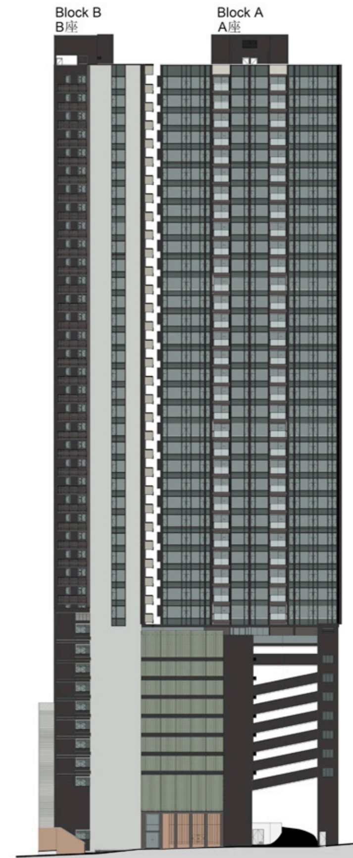
North Elevation 北面立面圖