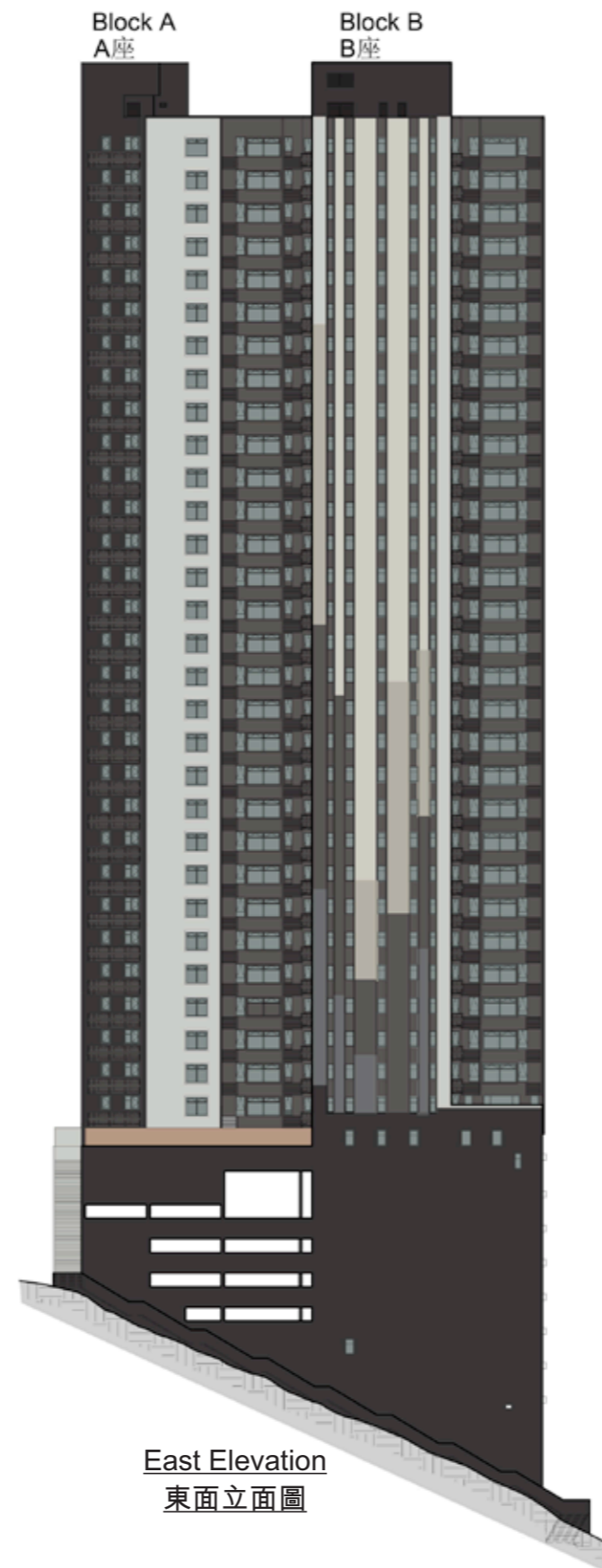
East Elevation 東面立面圖