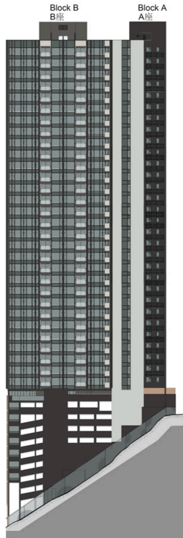
West Elevation 西面立面圖