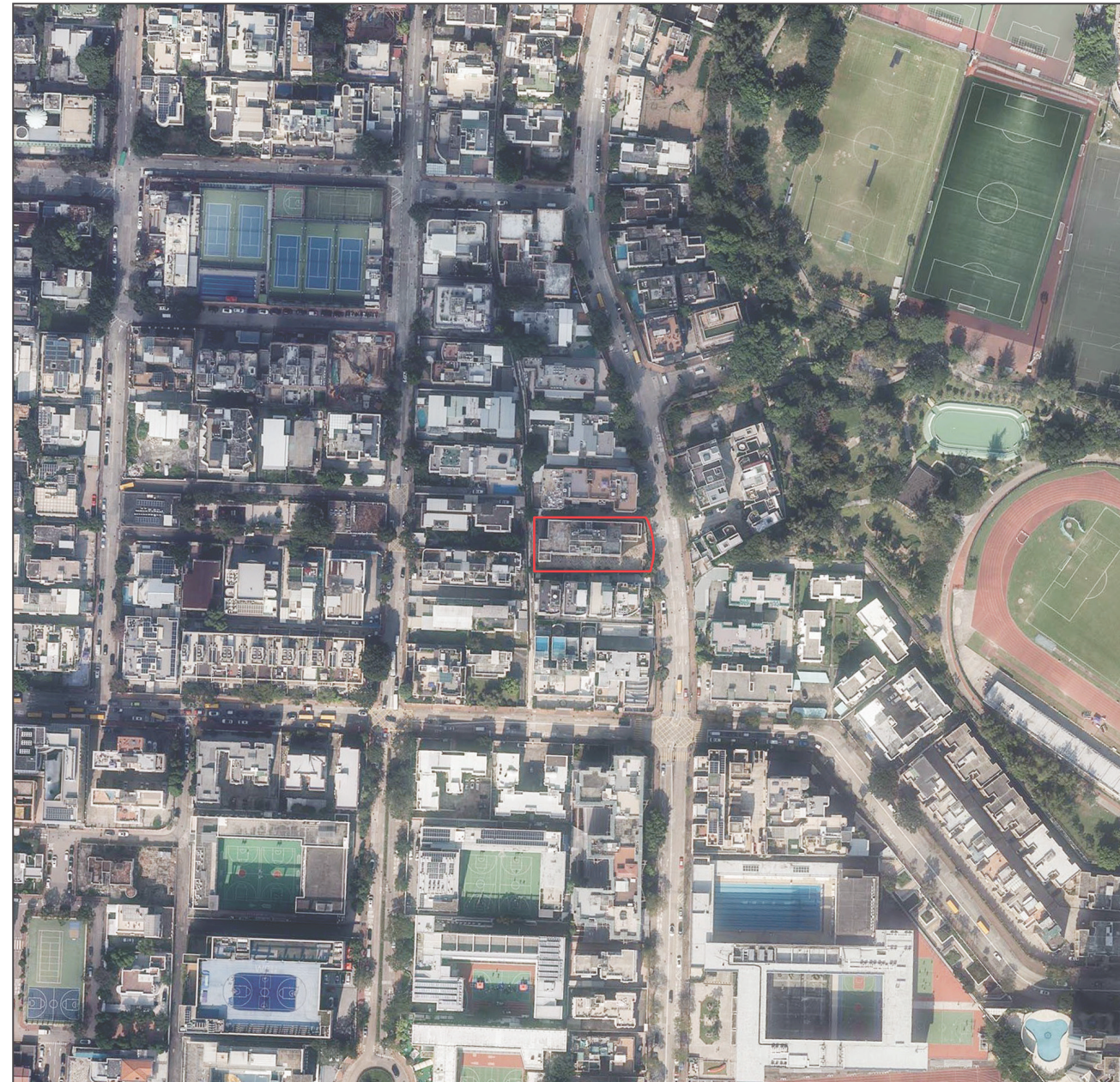
Location of the development 發展項目所在位置