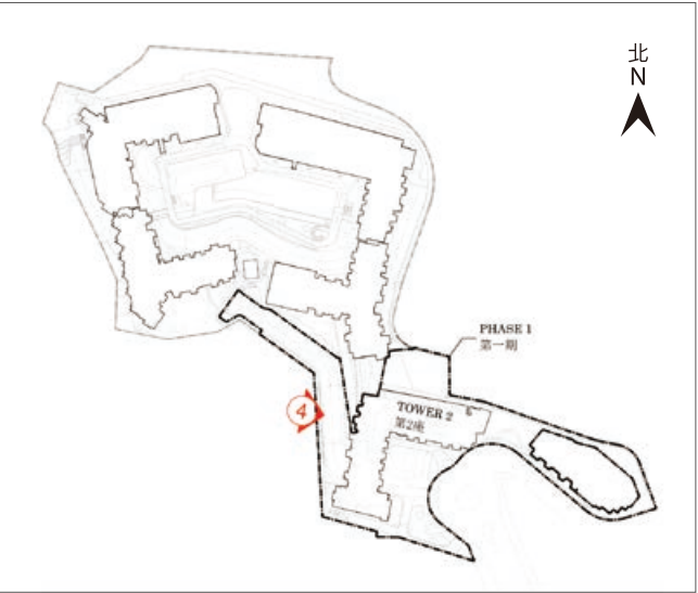
Key Plan 指示圖

Authorized Person for the Phase certified that the elevations shown on these plan: