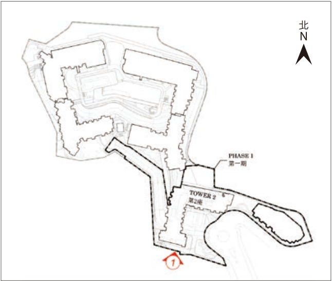
Key Plan 指示圖

Authorized Person for the Phase certified that the elevations shown on these plan: 1. are prepared on the basis of the approved building plans for the Phase as of 8 August 2024; and 2. are in general accordance with the outward appearance of the Phase.