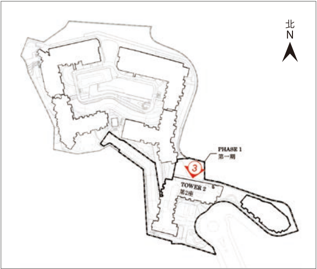
Key Plan 指示圖

Authorized Person for the Phase certified that the elevations shown on these plan: