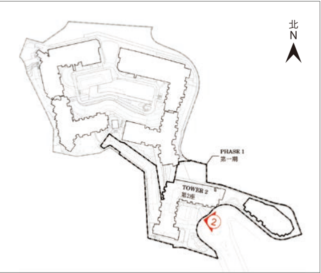
Key Plan 指示圖

Authorized Person for the Phase certified that the elevations shown on these plan: